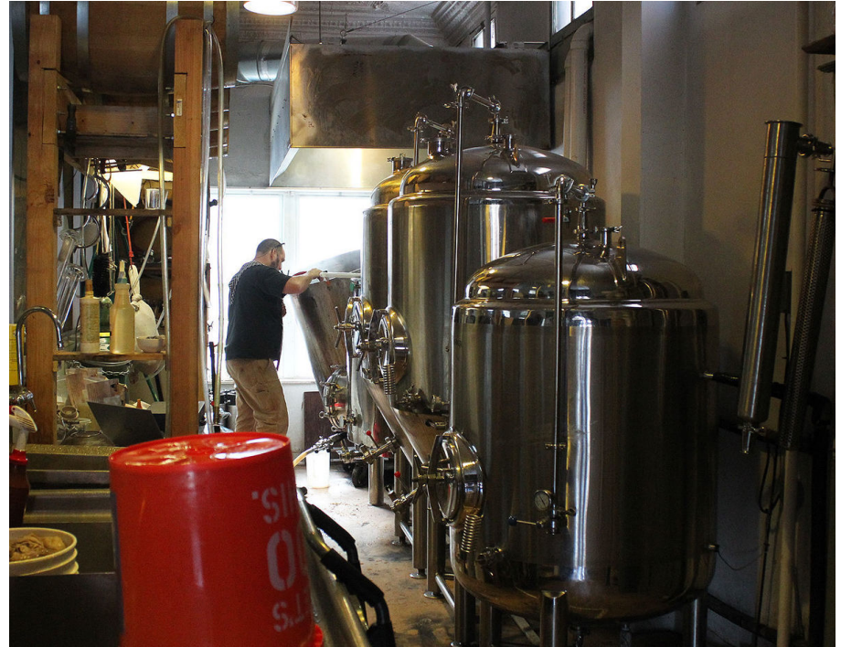
Lake Drum Brewing