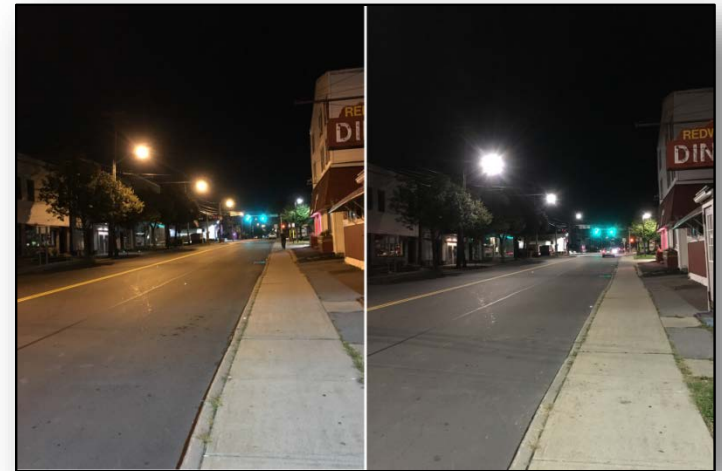
W Manlius St., Village of East Syracuse before (left) and after (right) LED streetlight conversion