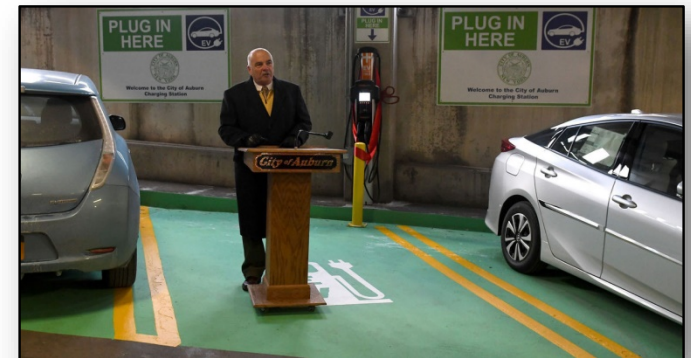
City of Auburn charging station installed at Lincoln Street Parking Garage