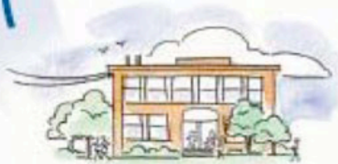
Occupancy / Maintenance