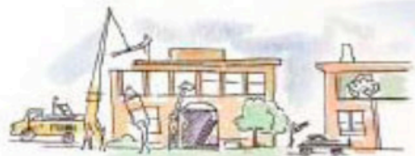
Deconstruction & Materials Reuse