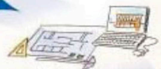
Design for Deconstruction