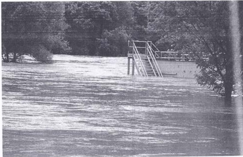
Another view of the Waste Water Management Facility.