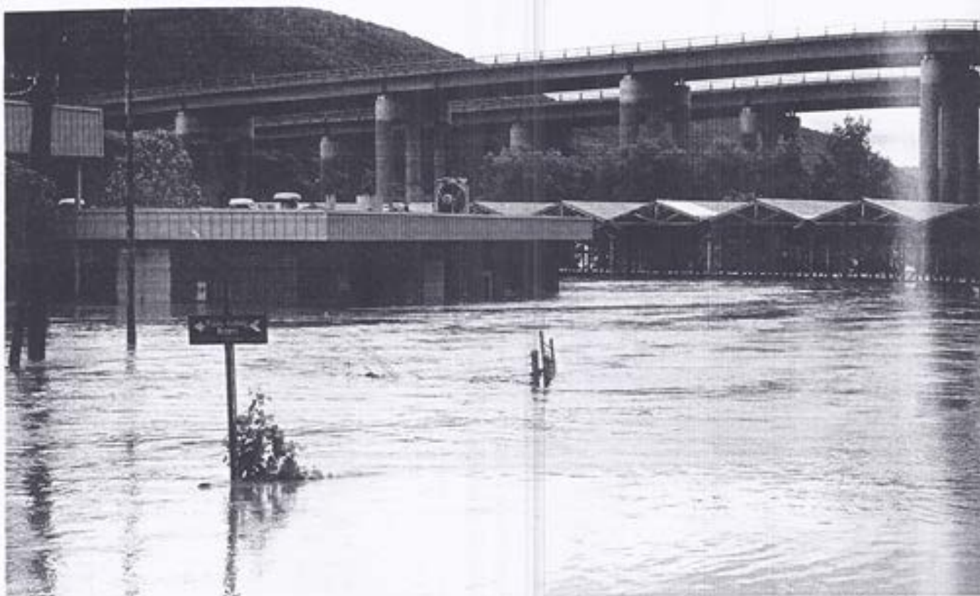
Flood waters nearly submerge the Deposit Waste Water Management (sewer treatment) Facility.